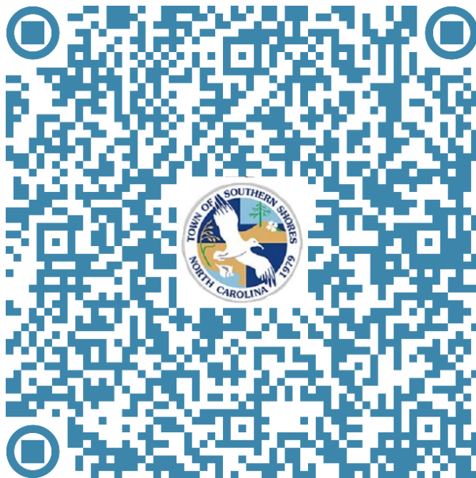
GOOGLE MAPS QR CODE

Property owners of the Town of Southern Shores are eligible to receive permits authorizing vehicle parking in sign-designated Town parking areas near beach accesses at no charge.