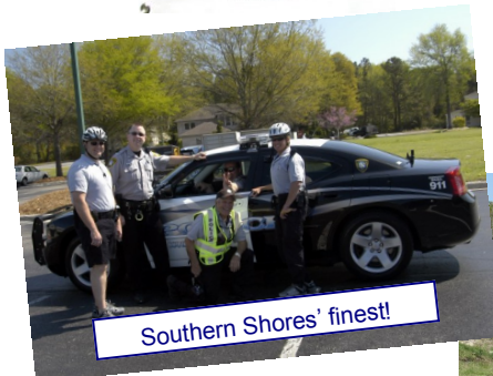
Southern Shores' finest!