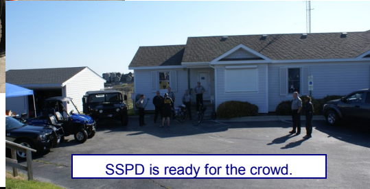
SSPD is ready for the crowd.