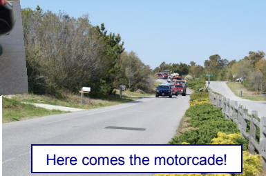
Here comes the motorcade!