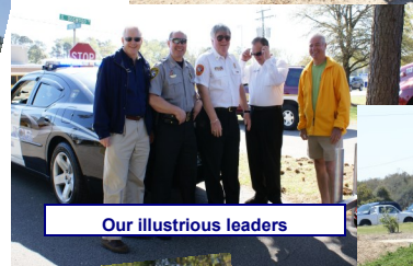
Our illustrious leaders