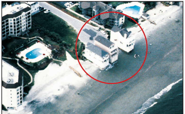
Figure 1. Well-built but poorly sited building.

A well-built but poorly sited building can be undermined and will not be a success (see Figure 1). Even if a building is set back or situated farther from the coastline, it will not perform well (i.e., will not be a success) if it is incapable of resisting high winds and other hazards that occur at the site (see Figure 2).