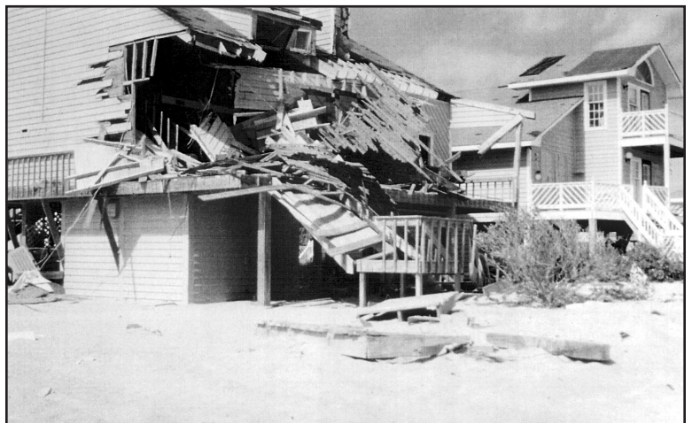
Figure 2. Well-sited building that still sustained damage.