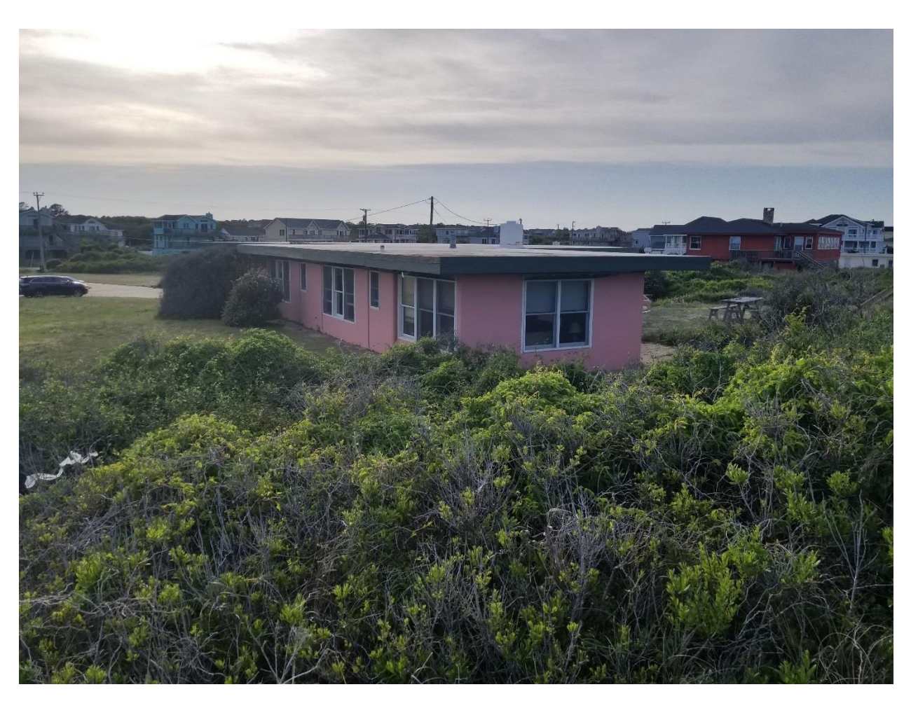
Pink Perfection, Southeast Face