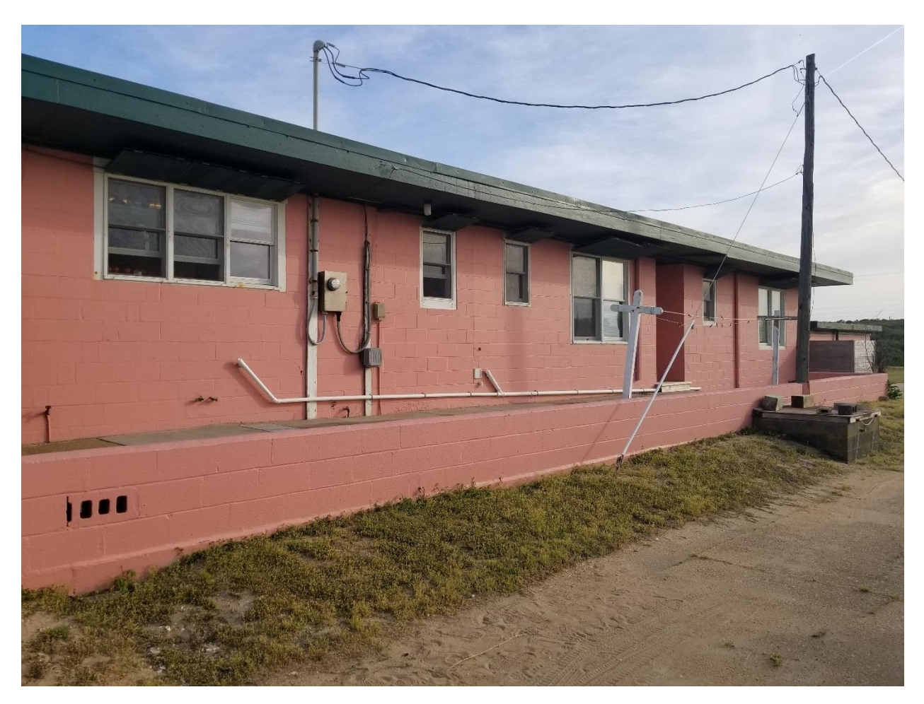
Pink Perfection, North Face