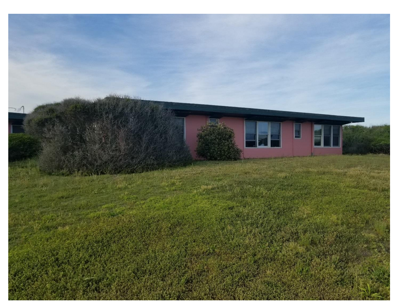
Pink Perfection, South Face