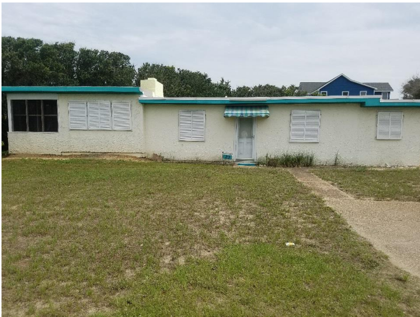
Figure 3: Front entry way