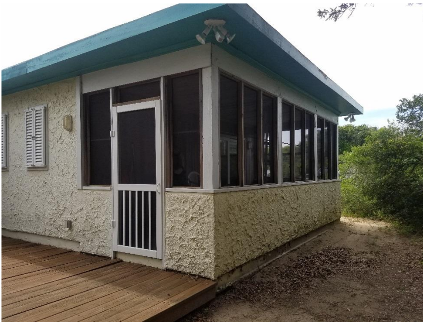
Figure 6: The screen porch that was added during the addition in April 2000.