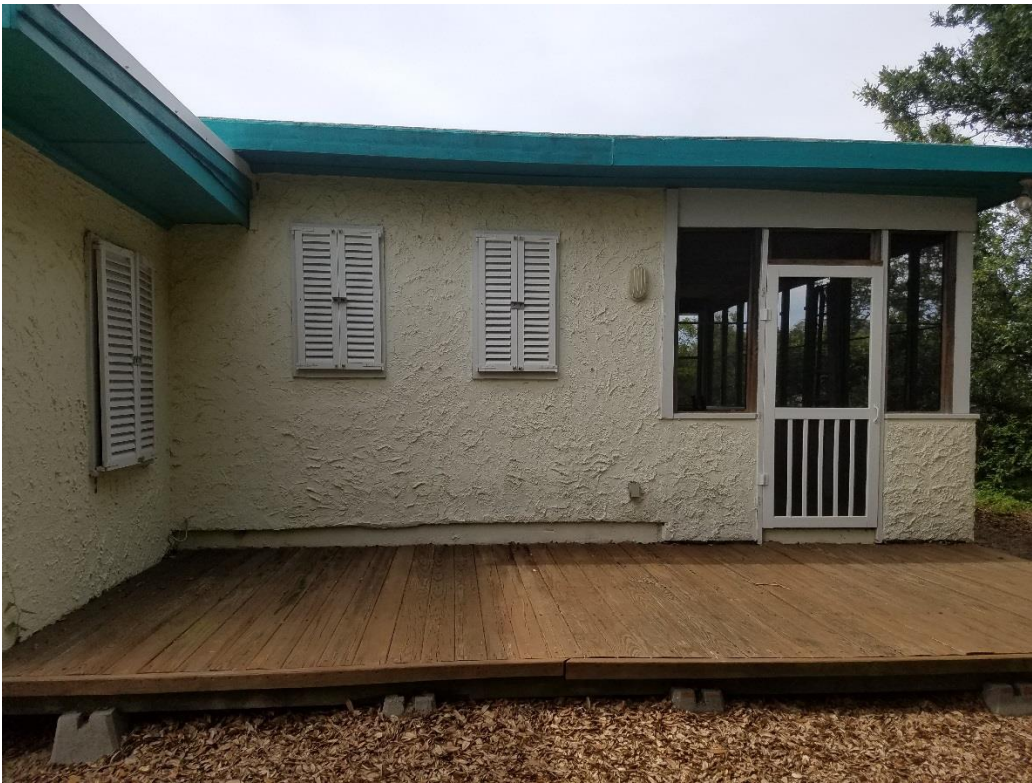
Figure 5: The back of the addition that was added in April 2000.