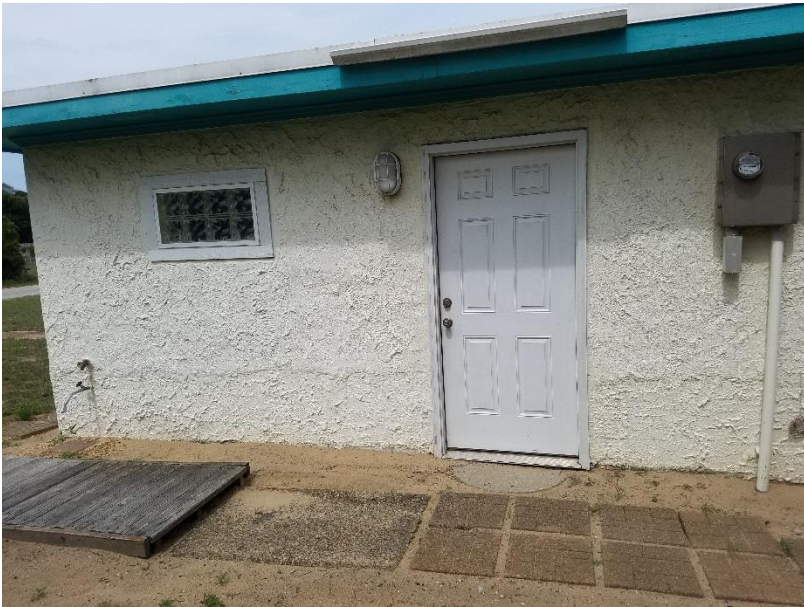
Figure 4: West side of 23 Porpoise Run