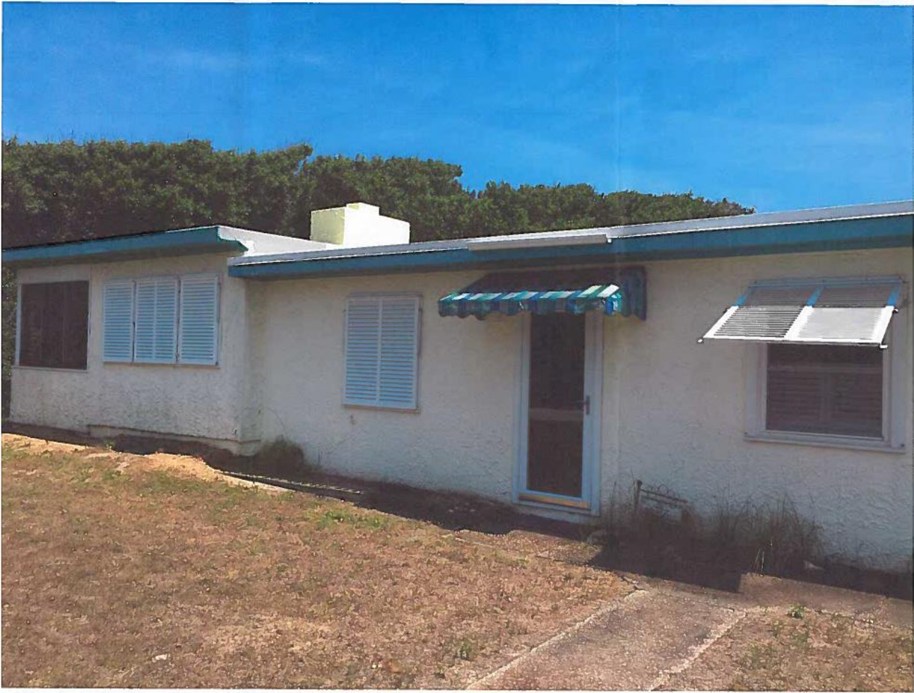
Figure 2: Front entry way of 23 Porpoise Run. Southern Shores, North Carolina