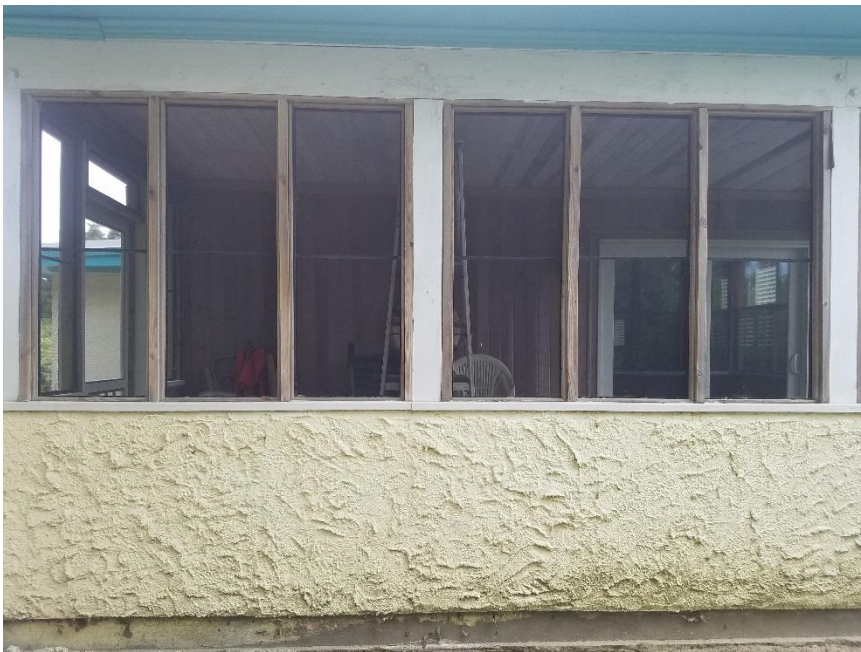
Figure 7: The east side of 23 Porpoise Run