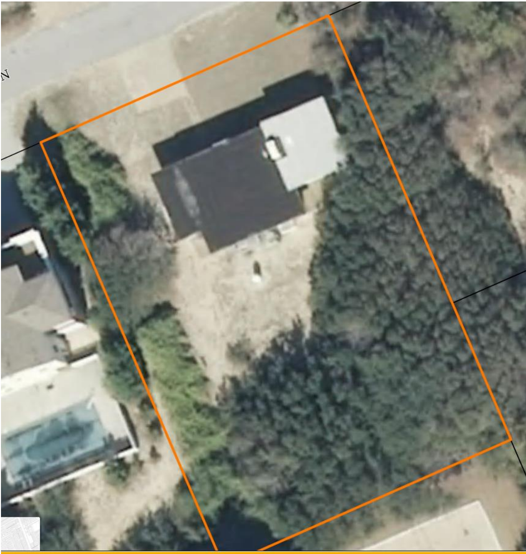
Figure 8: 23 Porpoise Run